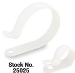
Stock No. 25025