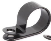
Stock No. 25067